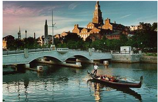
Revitalized Providence waterfront

An employer who participates in the Bonus Program, which provides job training for former public assistance recipients, can qualify for a $250 tax credit per participant. A certificate of eligibility from the RI Department of Human Services is required.