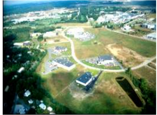
Quonset Business Park, North Kingstown

A manufacturer is allowed a 4% tax credit against the Rhode Island corporate income tax on buildings and structural components, as well as machinery and equipment, which are owned or leased and are principally used in the production process (including storage). Property principally used for administration and distribution purposes is not eligible. The investment tax credit may not reduce the taxpayer's liability below the minimum business tax. Unused credits may be carried forward for up to seven (7) years.