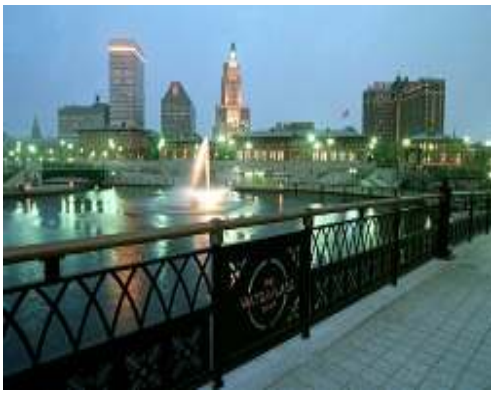
Waterplace Park, Providence.