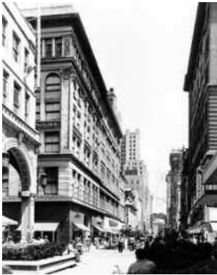
Historic downtown Providence

Rhode Island's state tax credit for rehabilitation of historic income-producing buildings is one of the most innovative in the nation, and has generated over $485 million in new private investment. Buildings that are listed on the National Register of Historic Places or which are located within a National Register Historic District (and contribute to the district's significance, or if it is part of a local historic district) are eligible.