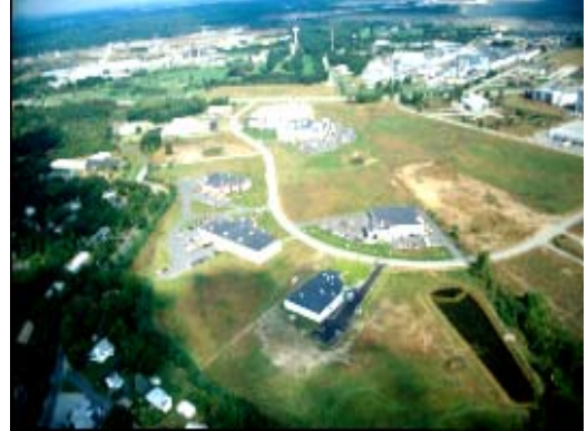
Quonset Business Park, North Kingstown

A manufacturer is allowed a 4% tax credit against the Rhode Island corporate income tax and the personal income tax on buildings and structural components, as well as machinery and equipment, which are owned or leased and are principally used in the production process (including storage). Property principally used for administration and distribution purposes is not eligible. The investment tax credit may not reduce the taxpayer's liability below the minimum business tax. Unused credits may be carried forward for up to seven (7) years.