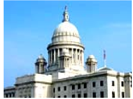
Rhode Island State House

Rhode Island, one of the most scenic and culturally-diverse locations on the East Coast, provides a natural setting for the production of motion pictures, films, television programs and other media. Colonial-era homes, Gilded Age mansions, urban skylines and open country vistas are all available in a compact area that is 48 miles long and 37 miles wide. The state is also home to one of the world's premiere art, design and technology institutions—the Rhode Island School of Design in Providence.