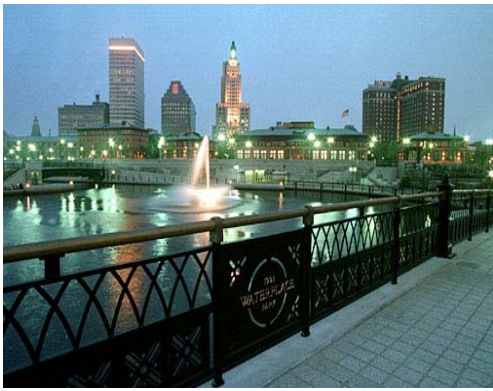
Waterplace Park, Providence.