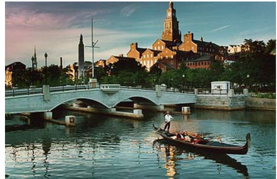
Revitalized Providence waterfront

A credit is available against the personal income tax for 10% of each $1,000 of the purchase price of qualifying artwork to a maximum purchase price of $10,000. The credit is available to taxpayers presenting written certification from the Board of Curators (see RIGL 42-97). Unused credits cannot be carried forward.