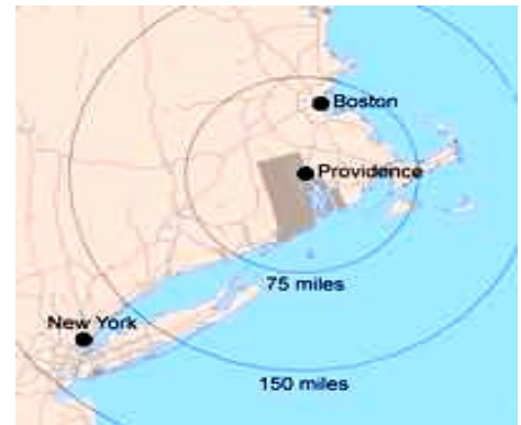
Rhode Island’s strategic location

Rhode Island’s innovation economy draws additional strength from its’ proximity to the largest concentration of higher education facilities in the United States. With high-caliber institutions like the Rhode Island School of Design and Brown University located within the State’s borders, high-tech brainpower is driving innovation in areas such as health and life sciences, industrial design, next generation defense research, and marine and environmental technology.